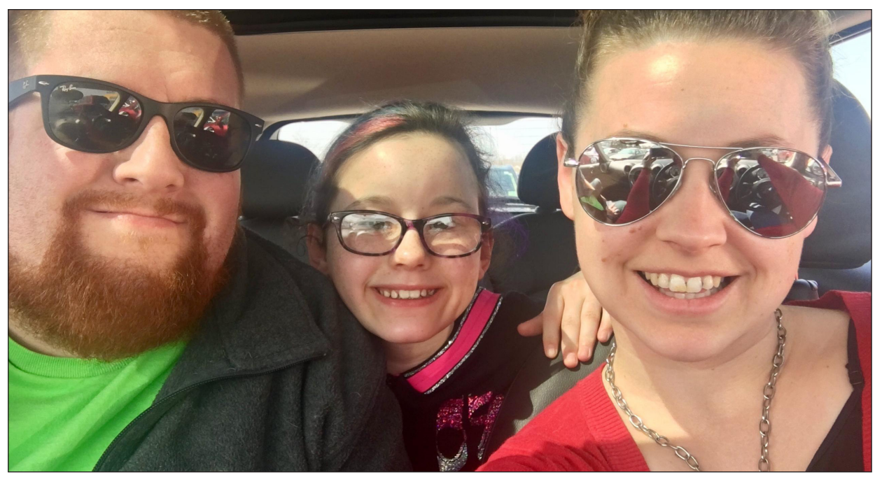
The Rynearson family.